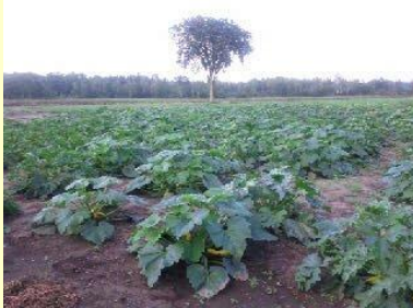
A LITTLE TOO MUCH